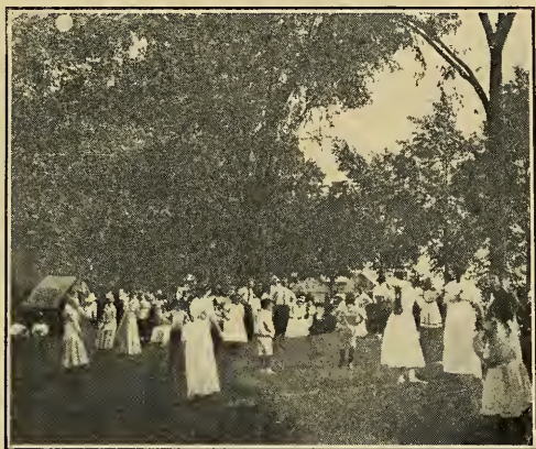
ORGANIZED PLAY, 1912 CONFERENCE

The Federation of Churches of Massachusetts ; The State Board of Education ; The Free Public Library Commission ; The Massachusetts Civic League ; The State Board of Health ; The County Work of the Young Men's Christian Association ; The National Board of the Young Women's